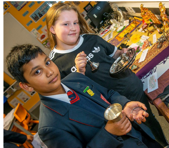
Pleckgate has a prestigious Gold Award Mark for the Religious Studies Department