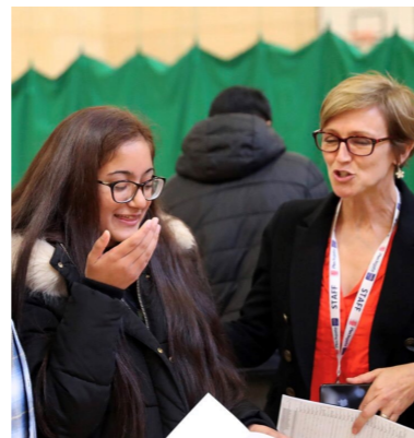
Teachers and pupils celebrating their outstanding exam results