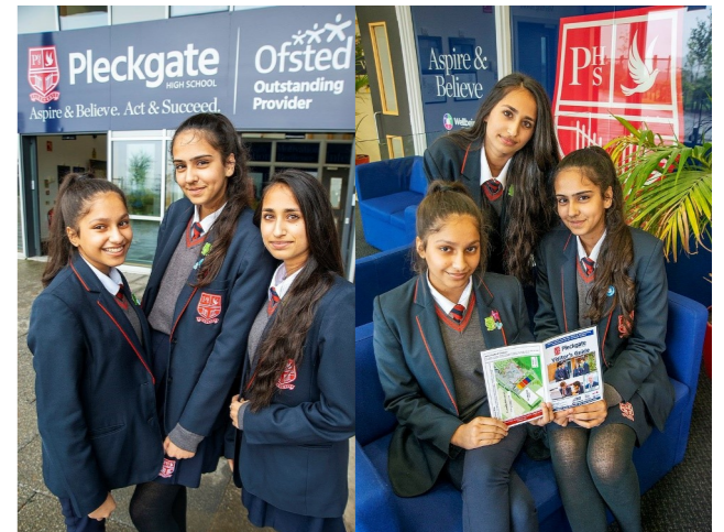
The newly built entrance and reception area to Pleckgate High School

Our attendance is above national average and we have high expectations and aspirations for all students – we expect the best for your child. I am here to stay to make sure every child at Pleckgate gets the best education. We want students to believe in themselves, to be safe, respectful citizens but also to have fun at school as well."