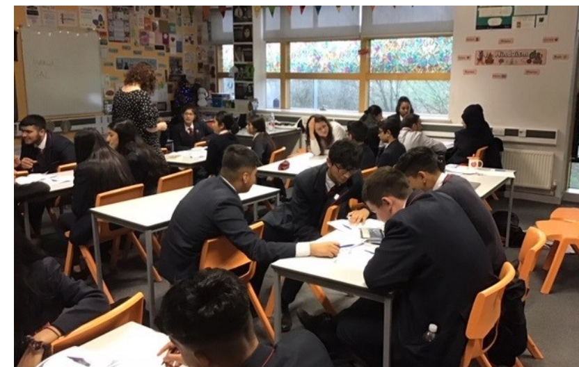
Pupils working in groups and deep in discussion