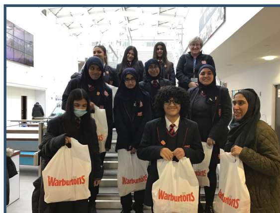
On their return to school with their goody bags filled with crumpets, pancakes and other delicious delights!