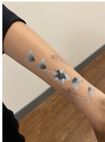
Construction and Art and Design