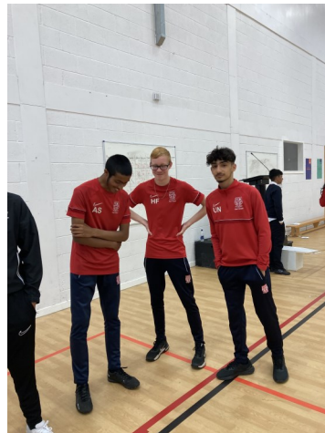
Sport and Hairdressing and Beauty