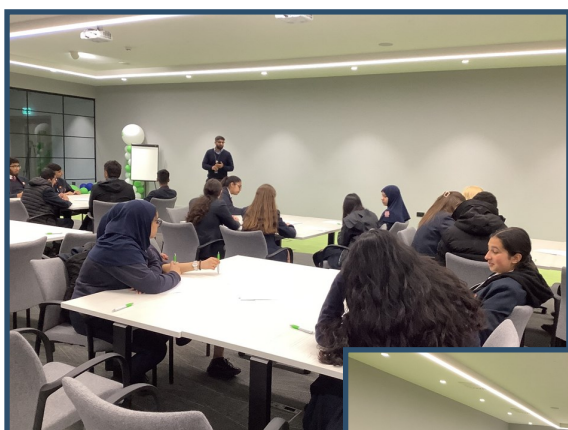
Listening to employees from the EG Group

10 NH visited EG Group as their workplace visit. This was a really useful visit for the pupils as they gained an insight into the structure and organisation of a business. After a short introduction about the business they were given a tour of the EG head office building and also had the opportunity to ask questions about the business. Pupils then participated in competitive group activities, one of which involved them designing a poster to then present their restaurant/takeaway business, highlighting its unique points. The presentations were judged and the best business was awarded a prize.