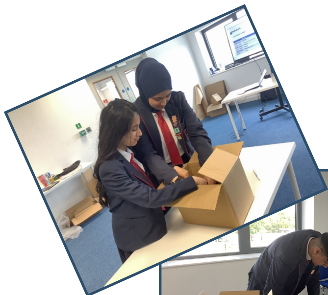
Pupils getting to grips with a packing task

Pupils in 10FJO also visited STACI this year, which is our link company. 4 tutor groups have had the benefit of visiting STACI this year. Here are some photos from the day.