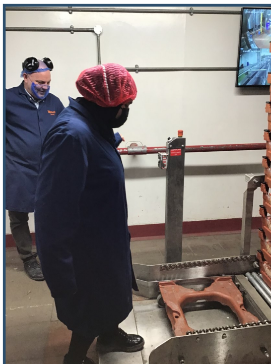
Watching how the pallets of produce get stacked