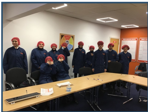
Pupils all kitted out in hair safety nets and overalls