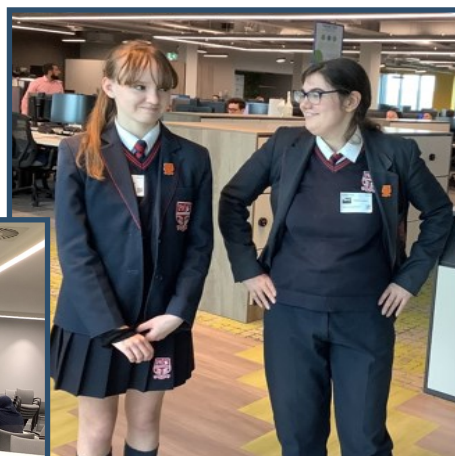
Looking at the office area