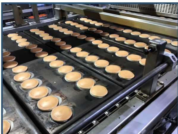
Pupils seeing how manufacturing occurs for pancakes on the production line