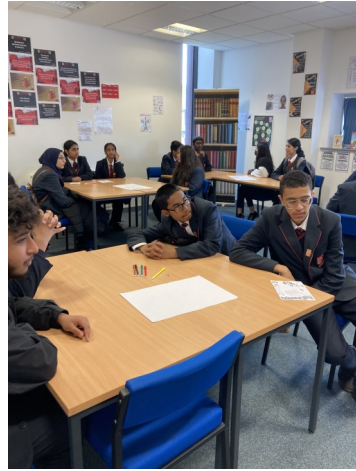
Pupils in one of their chosen subjects