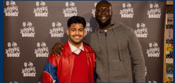
Chart-topping musician Stormzy set up the #Merky Books prize to discover unpublished and under-represented writers aged 16 to 30 from the UK and Ireland.